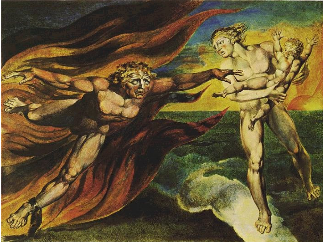
William Blake – Good and Evil Angels c. 1805