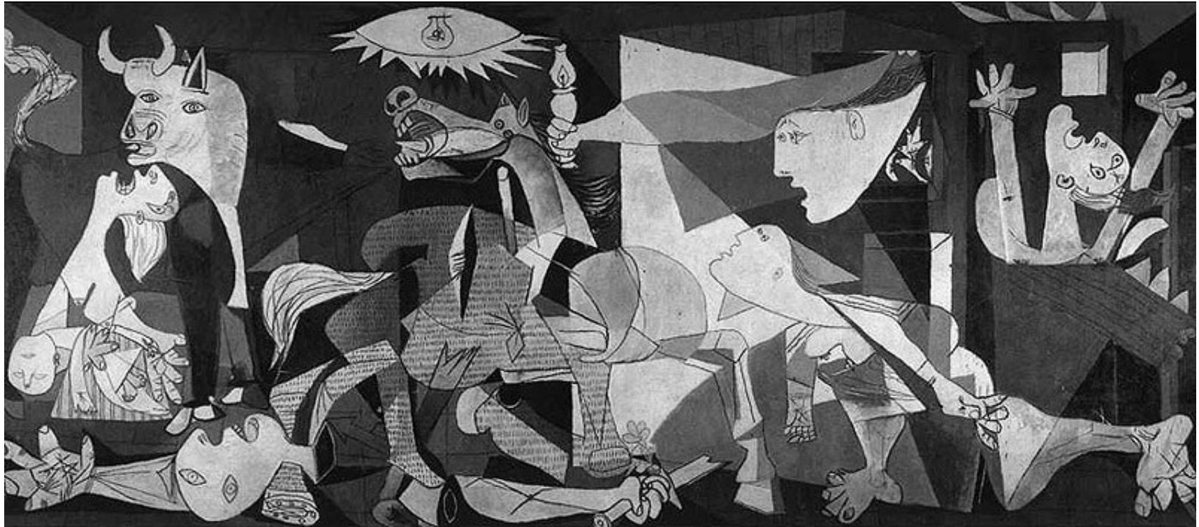
Pablo Picasso – Guernica 1937