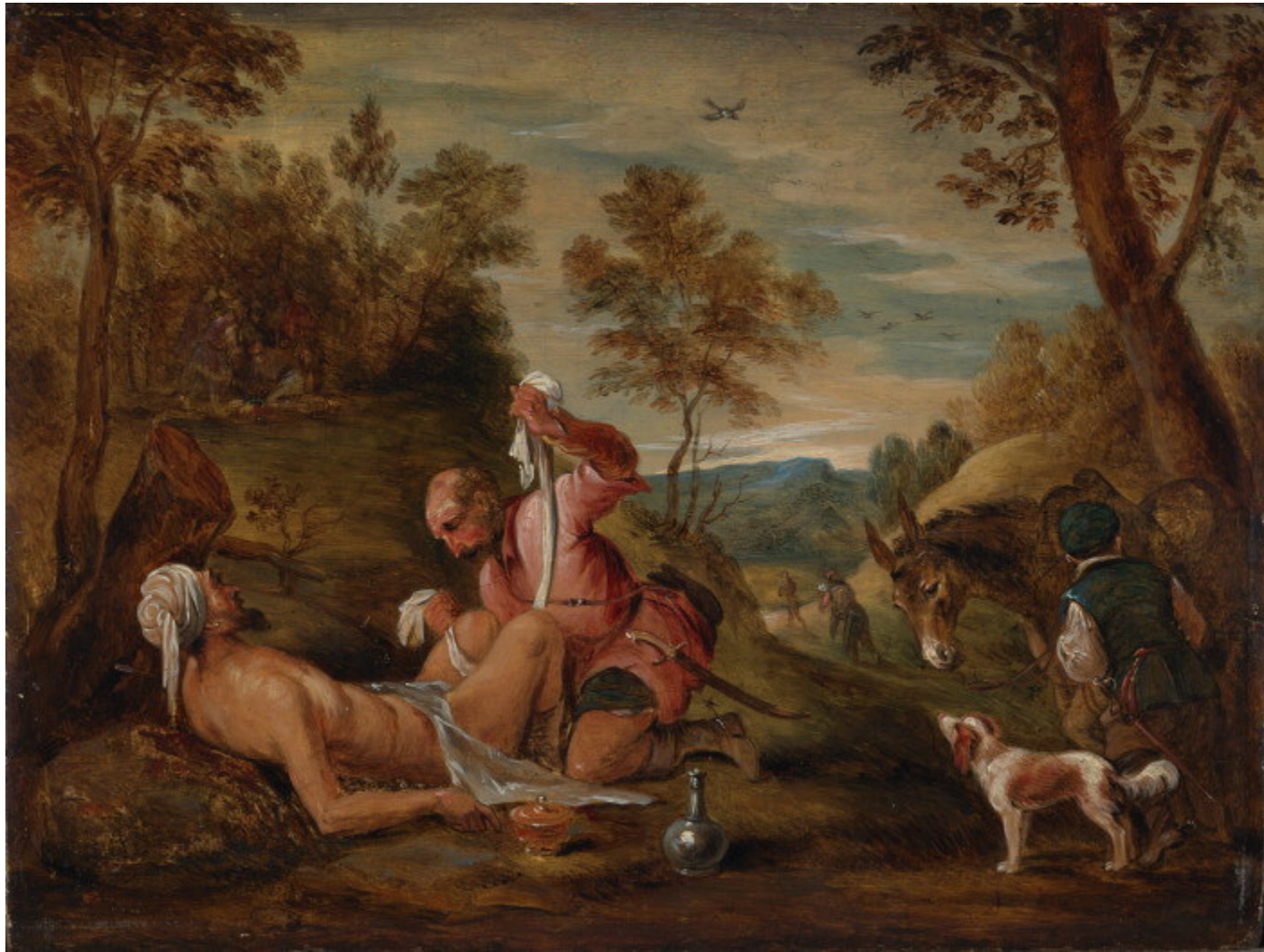
Francesco Bassano - The Good Samaritan c. 1650