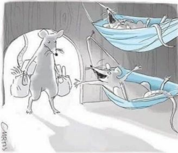
"FREE HAMMOCKS, all over town. It's like a miracle!"

Post-apocalyptic fiction has been moved to current affairs.