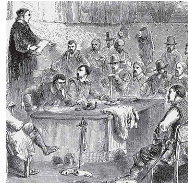
Image: Meeting of the Virginia House of Burgesses, 1619.

Chattel slavery in the United States, with its distinctive – and strikingly cruel – laws and structures, took shape over many decades in colonial America. The innovations that built American slavery are inseparable from the construction of Whiteness as we know it today. By John Biewen, with guest Chenjerai Kumanyika.