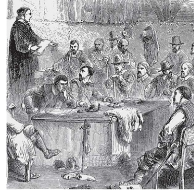
Image: Meeting of the Virginia House of Burgesses, 1619.

Chattel slavery in the United States, with its distinctive – and strikingly cruel – laws and structures, took shape over many decades in colonial America. The innovations that built American slavery are inseparable from the construction of Whiteness as we know it today. By John Biewen, with guest Chenjerai Kumanyika.