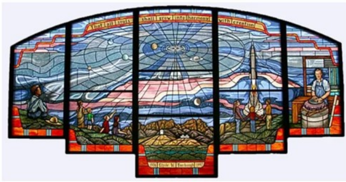
Tombaugh stained glass window

We have transitioned to hybrid services. See mpuuc.org/zoom each week for how to attend services.