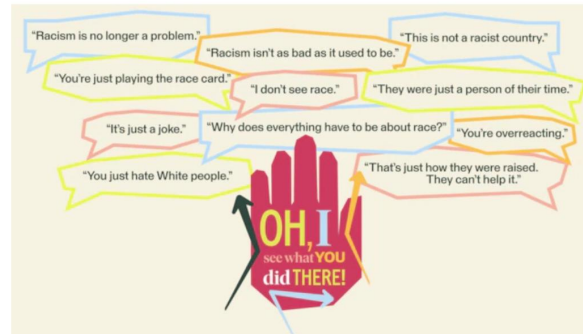
Examples of racism denial.