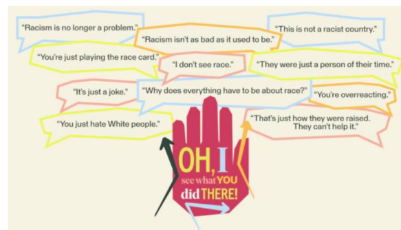
Examples of racism denial.