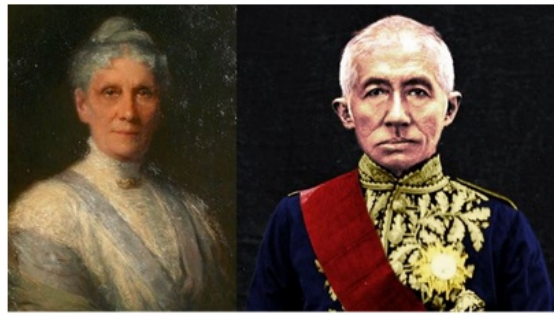
Anna Leonowens and King Mongkut

Service can be attended in-person at Cole Hall or online. See mpuuc.org/zoom each week for how to attend services.